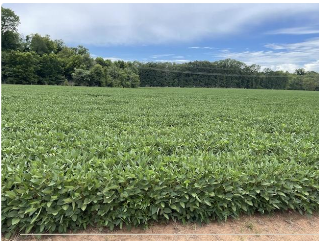
Louisiana Outdoor Properties · LouisianaOutdoorProperties.com Soybean field with the on-site transmission line at the treeline