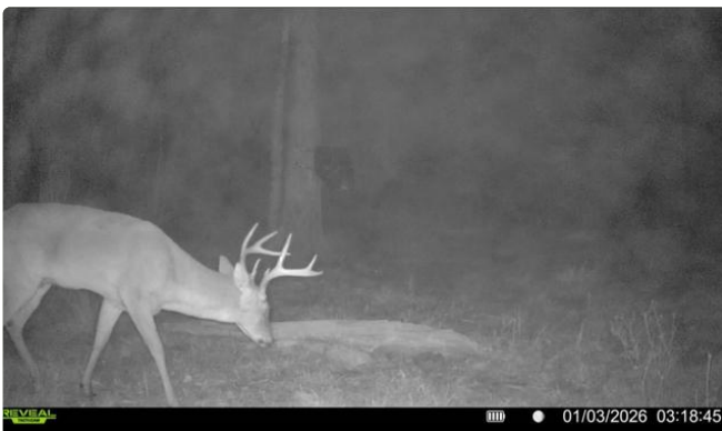
Buck feeding — 1/03/2026