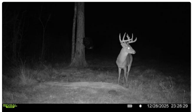
Buck at feeder — 12/28/2025