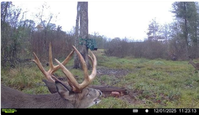
Mature trophy buck — 12/01/2025

The trail-cam library on this tract tells the real story. The combination of dense timber bedding cover, mature mast-producing trees, and the soft food edge created by the surrounding soybean fields concentrates deer year-round — including the kind of mature bucks most hunters are after.