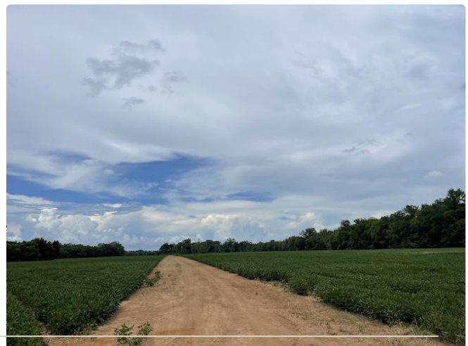
Open ag ground with farm road and timber edge