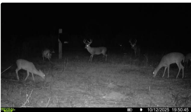
Multiple deer at feeding station — 10/12/2025