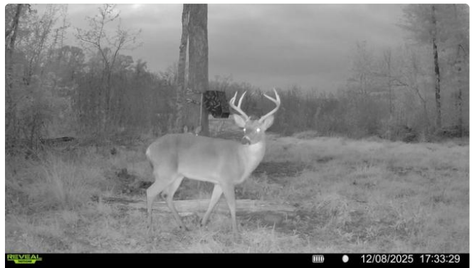
Mature buck near feeder — 12/08/2025